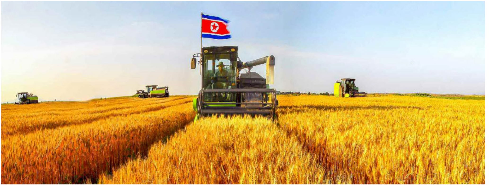
Wheat and barley harvest is under way at the Sangphal Farm of Mundok County, South Phyongan Province.