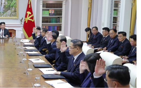
The Third Meeting of the Political Bureau of the Ninth Central Committee of the WPK