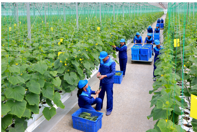
Vegetables are gathered at the Kangdong Combined Greenhouse Farm (left) and the Sinuiju Combined Greenhouse Farm (right).