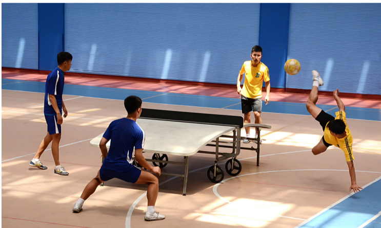
A scene of a match of the team event between the Kim Jong Thae Electric Locomotive Complex team and the Ministry of Light Industry team at the 2026 teqball competition.