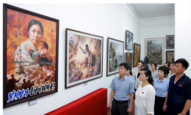
Visitors look round the exhibits at the art exhibition on the theme of class education at the Pyongyang International House of Culture.

There are also artworks disclosing the thrice-cursed heinous crimes committed by the Japanese imperialists while occupying Korea for